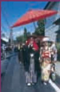
Minowanosato and Kitsune-no-yomeiri Pageant