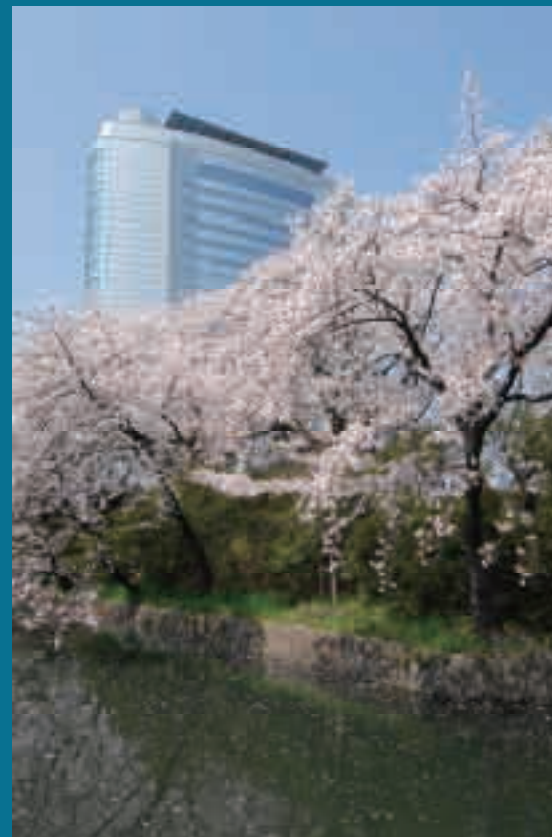
The information posted on this site is current as of January 2008.

Please contact Takasaki Municipal Tourism Society Takasaki Tourism Association Address: 35-1 Takamatsu-cho, Takasaki-shi, Japan 370-8501 Phone: (+81) 27-321-1257 E-mail: kankou@city.takasaki.gunma.jp http://www.city.takasaki.gunma.jp